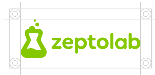
Secondary Logo with safe area